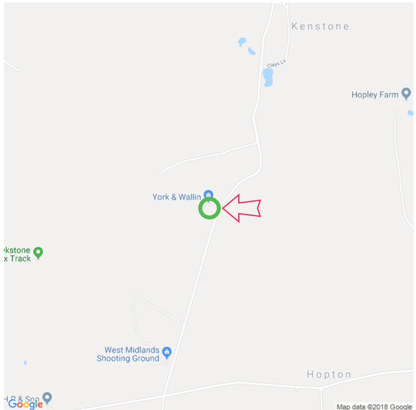
Wrekin View Naturist Club (17-07-2018)