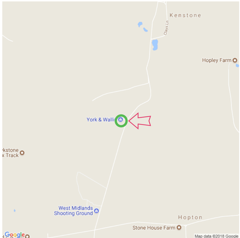
Wrekin View Naturist Club (21-04-2018)