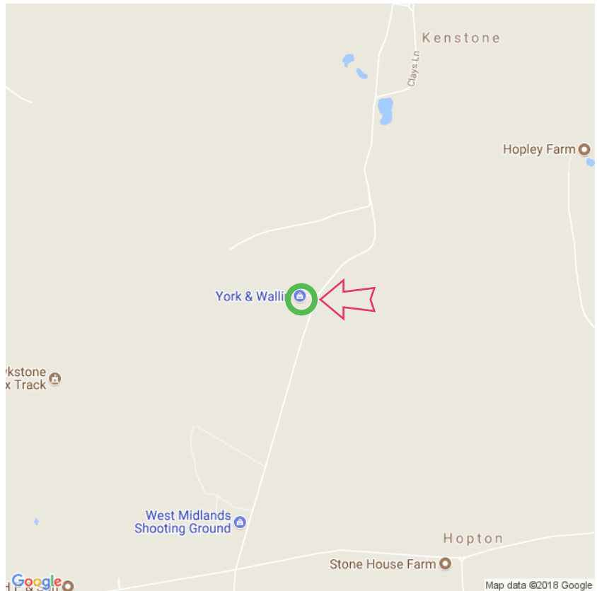
Wrekin View Naturist Club (24-01-2018)