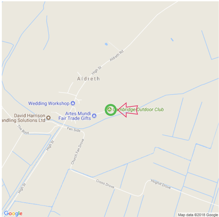
Cambridge Outdoor Club (25-04-2018)