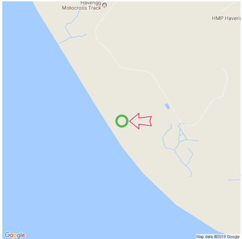
Lakeland Outdoor Club (20-01-2018)