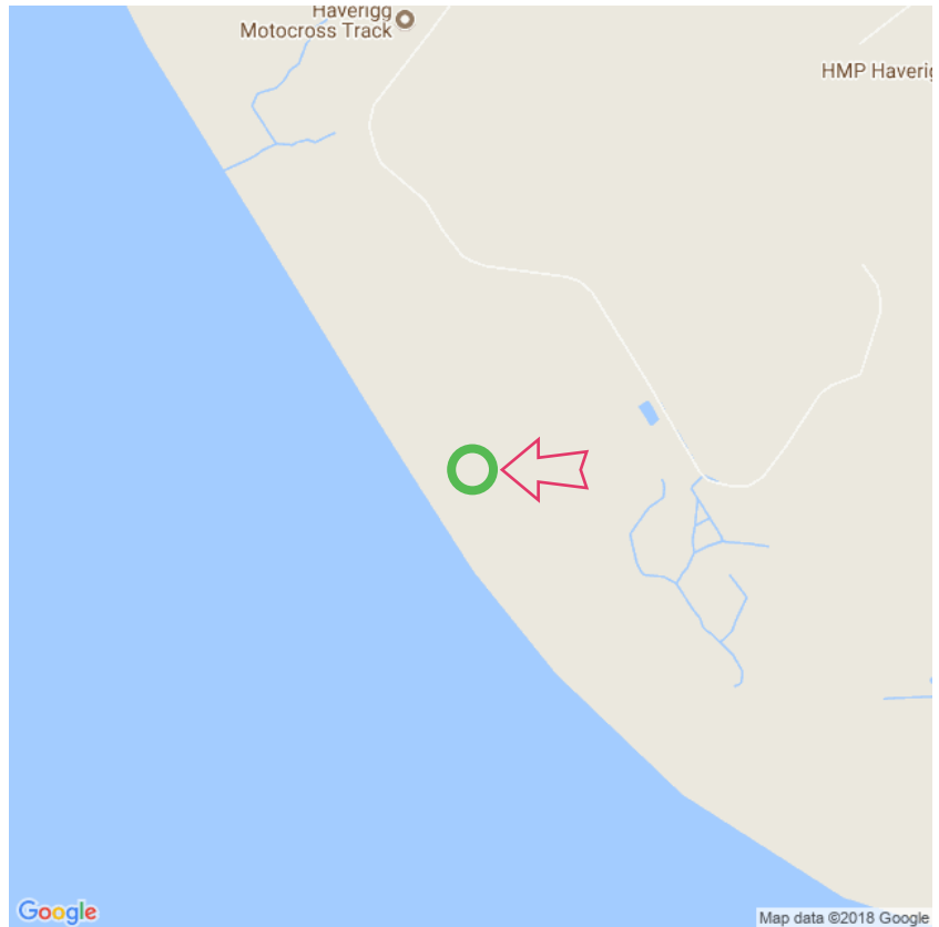
Lakeland Outdoor Club (21-06-2018)