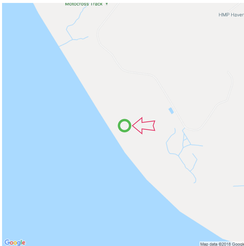
Lakeland Outdoor Club (15-08-2018)