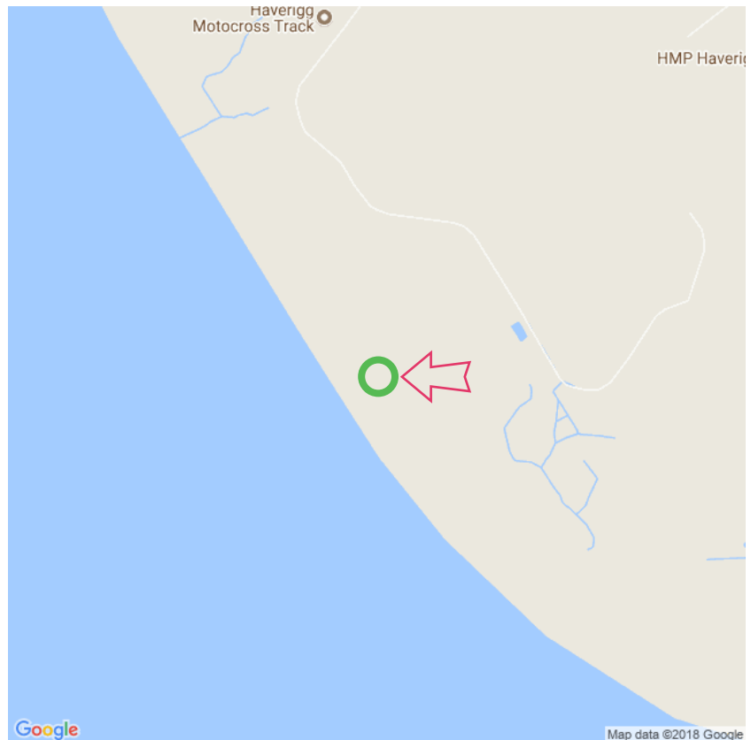
Lakeland Outdoor Club (27-04-2018)