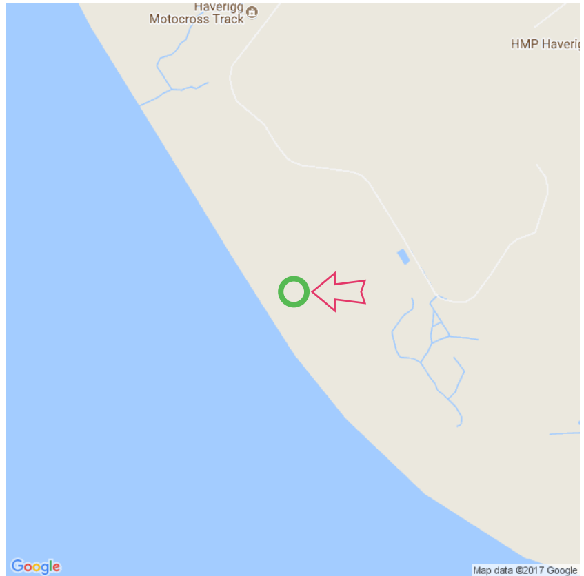
Lakeland Outdoor Club (10-11-2017)