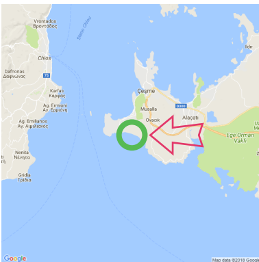
Cesme Altinkum Beach (20-02-2018)