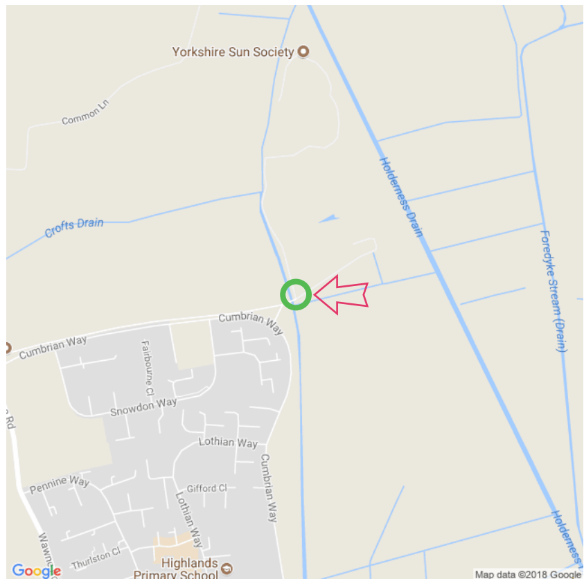
Yorkshire Sun Society (21-04-2018)