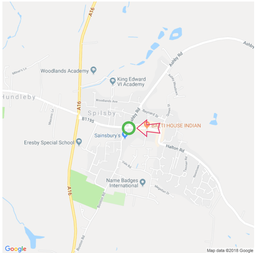
Lakeside Farm (23-07-2018)