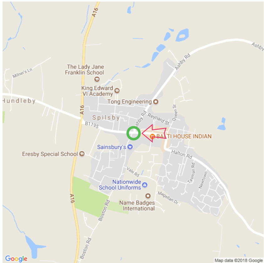
Lakeside Farm (25-04-2018)